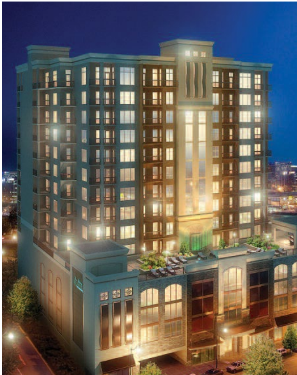
Rhythm at Music Row, Nashville, TN Architect: Wakefield Beasley & Associates