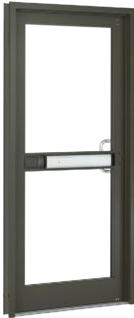
Series 400 Entrance with Mid Panel Exit Device