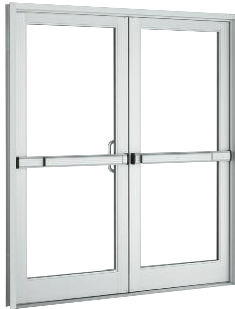
Series 400 Entrance with Standard Exit Device