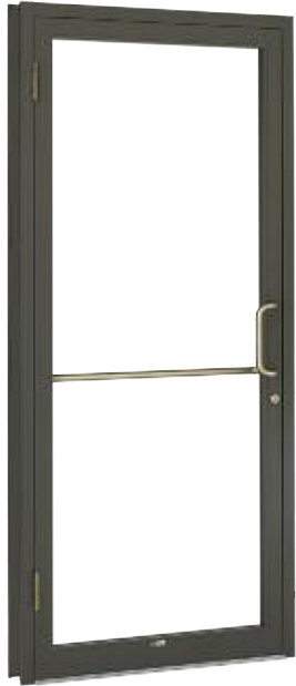
Series 250 Entrance with Champagne Finish Hardware

As an industry leader in the manufacture of entrance doors and frames, United States Aluminum products are consistently built to the highest industry standards, ensuring years of reliable service. Mechanically fastened shear blocks and welded corner construction creates a rugged structural corner assembly backed by a lifetime warranty. These entrances can easily accommodate a wide variety of custom hardware for specific job requirements.