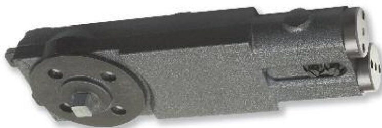
Arm for Center Hung Doors