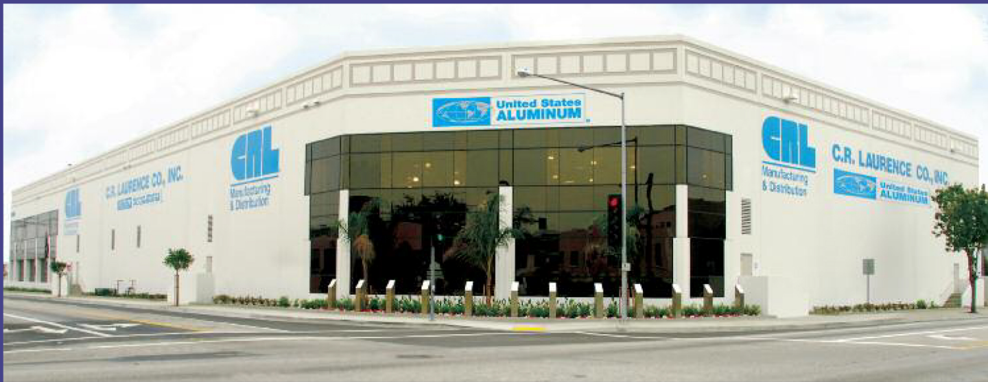
The New U.S. Aluminum Facility in Los Angeles, California