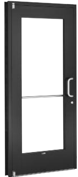
Series 550 Entrance with Clear Hardware and 10" (254 mm) A.D.A. Bottom Rail