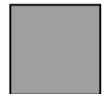
SCS1009 Aluminum (metallic)