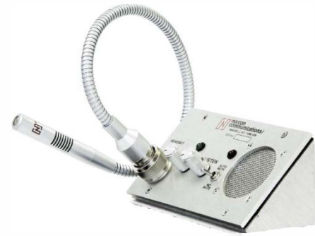
Norcon TTU-7X Installation & Operating Instructions