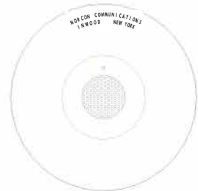
TTU-7X Outside Unit