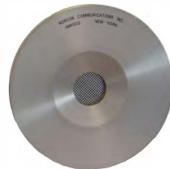
Window Glass mounted (Customer side)

Please specify barrier thickness when ordering. The prism unit is quickly and easily mounted on the counter-top on the inside of the barrier, at a convenient location for the user. A power adapter and all cables are supplied. The TTU-7X comes with a continuous-duty, 90-240 VAC 1 Amp power supply which is stepped down to 15 Volts.