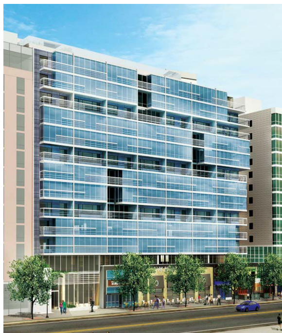
701 Ballpark Square Location: Washington, D.C. Architect: Hickok Cole Architects