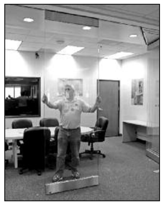
Fig. 6 Stacking the Panels

There are many parking area configurations, each one requiring slightly different panel movements. Some configurations park at slight angles, not always in line with the wall or exactly perpendicular to the wall. This is intentional as it makes the panels move more smoothly in and out of the parking area. Do not force these panels to be flat up against the wall, or into an exact perpendicular orientation.