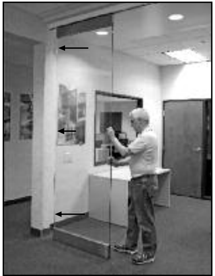
Fig. 2 Positioning the Lead Panel