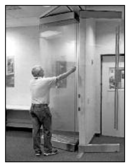
Fig. 1 Beginning to extend the panels by pulling the leading edge

Walk the panel across the opening until it reaches the opposite wall. Slow the panel's movement before contacting the wall to prevent damage, Fig. 2.