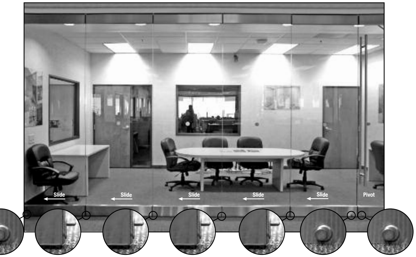
Fig. 5 Typical Locking Configuration

Cautiously move the remaining sliding panels into position at a walking pace, and engage floor bolts when in position.