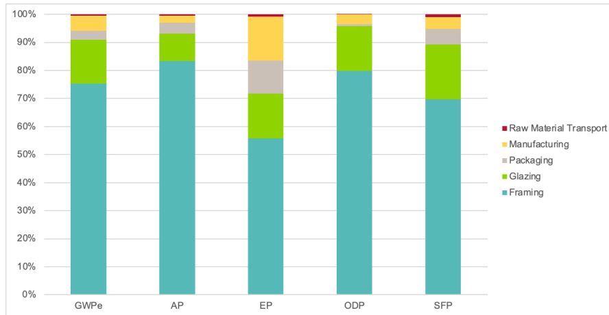
Figure 3: IPCC AR6 and TRACI 2.1 Summary

ranging from 10% - 19% of A1-A3 impacts. Here, glass components within the glazing drives impacts.