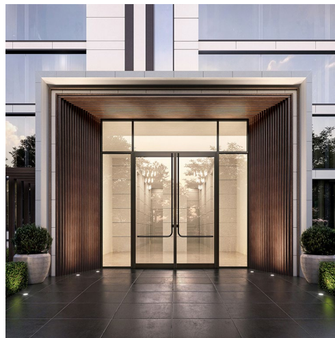
Figure 1: Entice HP+

The Entice® HP+ Entrance and Storefront System introduces engineering advancements that surpass industry standards in aesthetics and performance. Monumental glass doors spanning 10 feet tall and 4 feet wide can be specified with ultra-narrow 1-5/8" door stiles to convey a grand entrance and heavy-glass visuals. Narrow-frame sidelights and transom complete the striking look. As an AAMA CW Performance Class rated system with a full perimeter seal, Entice® HP+ offers year-round, all-weather performance that asserts its status as a next-generation entrance and storefront. Structural enhancements have also given the system superior design pressure capacities.