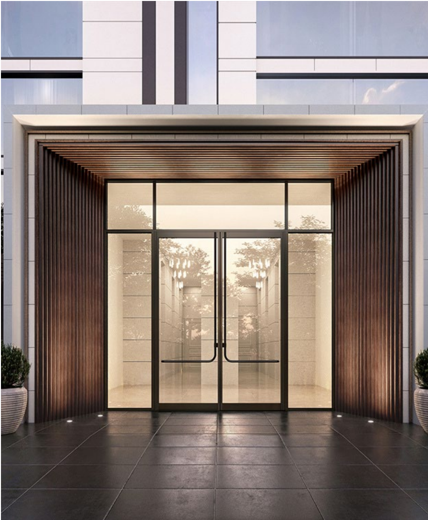
Entice HP+ is an entrance and storefront system.